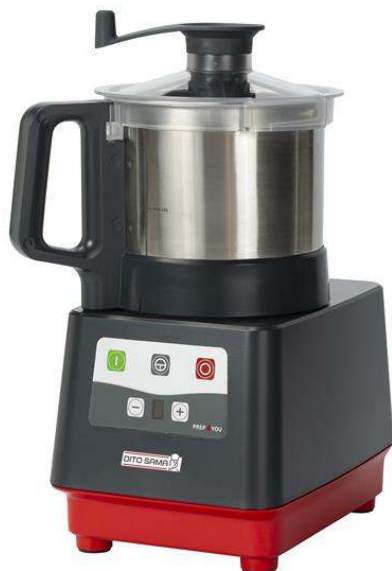
602224 (DKSS36PVSAU) Cutter mixer 3.6 lt with stainless steel bowl, sealed lid, variable speed 500-3600 rpm, Australia